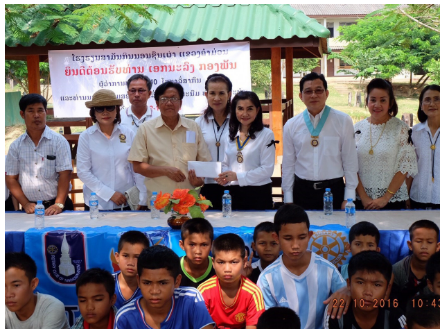
Rotary Club of Nakhonphanom provided scholarships and sport equipment to the boarding schools in Lao PDR.