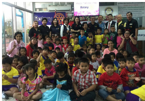
Rotary Club of Buengkum joined a project with Mother and Child Health Development Center in Suwanprast Community.