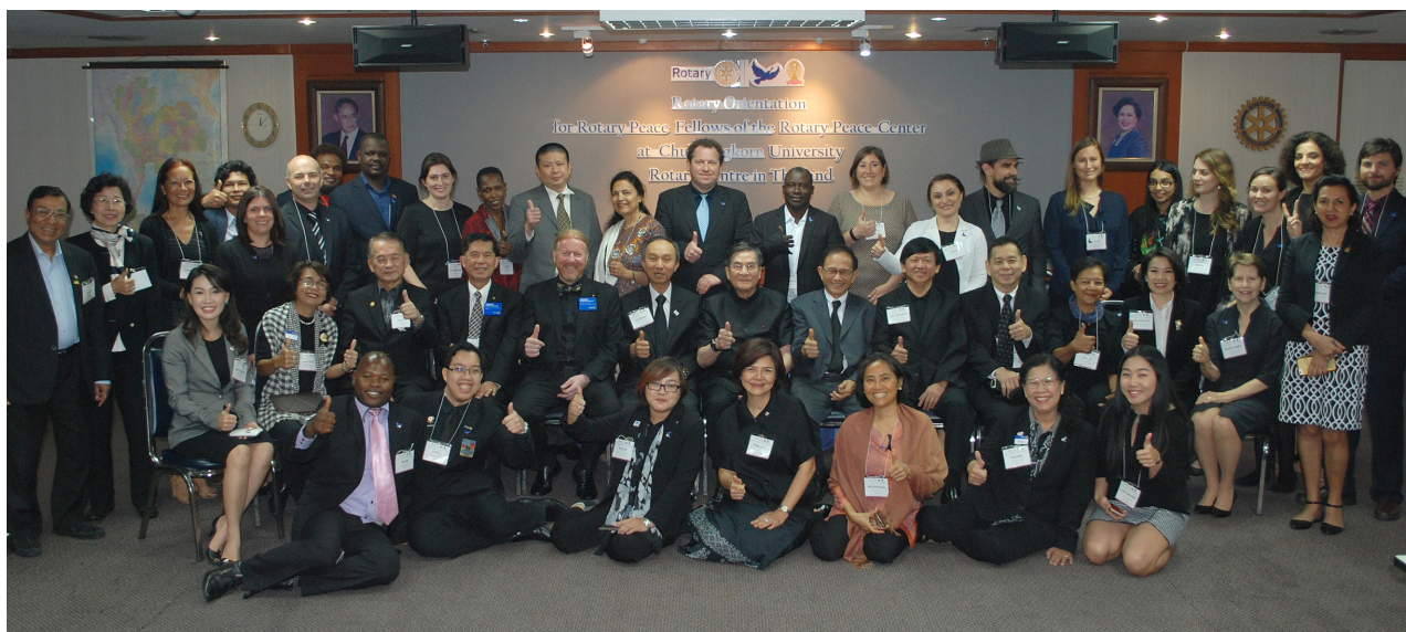
The Class of 22 Peacefellows with Rotarian host councillors

สันติภาพและความขัดแย้ง Peace and conflict prevention/resolution