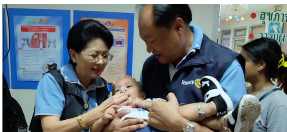
Rotary Club of Bangpa-in with Rotary Club of Tharua, Ayutthaya gave polio vaccination at Tharua Hospital. Phra Nakhon Si Ayutthaya.