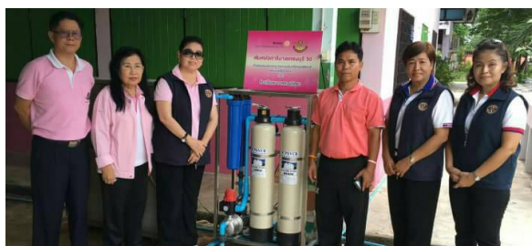
Rotary Club of Bangkai - Dhonburi 50 donated water filtration system to Wat Rat Samakkhitham.