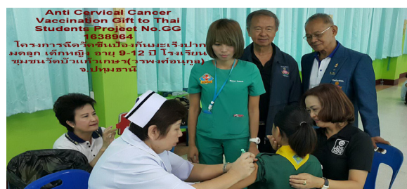
Rotary Club of Pathum Thani gave vaccination against cervical cancer in Wat Bua Kaew community.