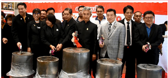
Rotary Club of Chantaboon organized an activity to get rid of cookware with leads.