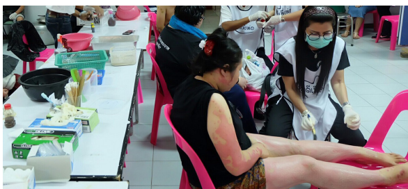
Rotary Club of Chantaboon and members helped patients with psoriasis at Thachang Municipality, Chanthaburi.