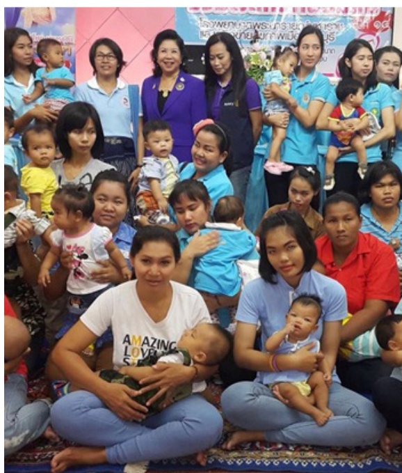
Rotary Club of Pranarai Lopburi organized a project, "Mother Breastfeeding and Children" in Tha Sala community.