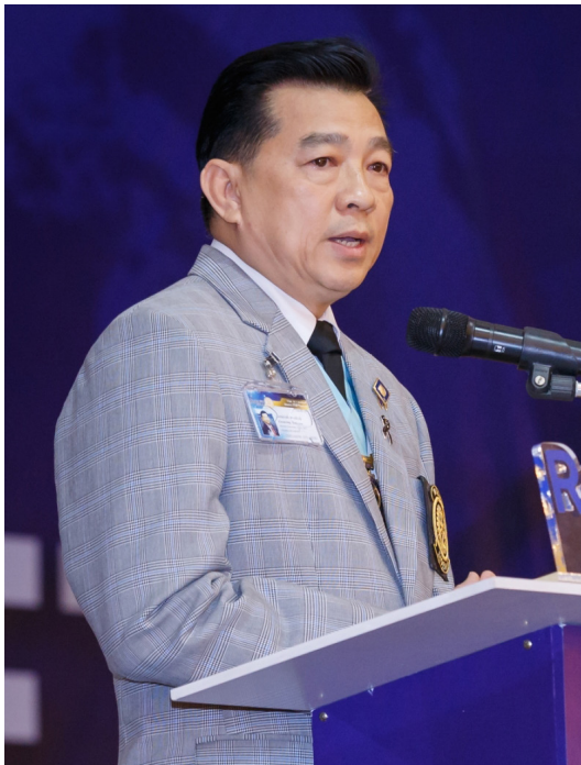
DG Ekharong Kongpan District 3340

By PP.Puttiporn Pattanasintorn RC of E-Club of District