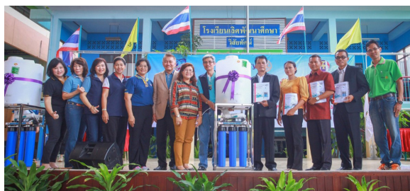
Rotary Club of Phrapokklao Dhonburi donated water filters to Lertpattana School.