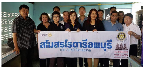
Rotary Club of Lopburi donated water filtration systems to communities and schools.