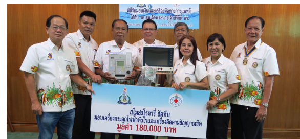
Rotary Club of Sattahip donated medical instruments for heart and vital signs to Queen Sirikit Hospital, Sattahip, Chonburi.