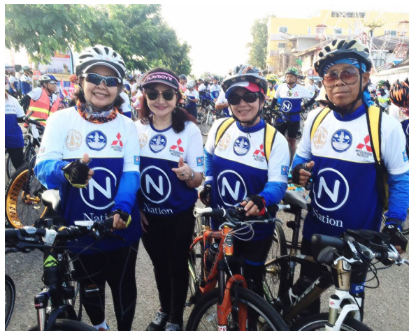
Rotary Club of Nakhonphanom participated in a Thai-Laos-Vietnam Cycling.

สันติภาพและความขัดแย้ง Peace and conflict prevention/resolution