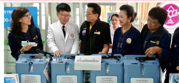
Rotary Club of Roi Et provided medical equipment, oxygen production equipment, and subcutaneous injection equipment