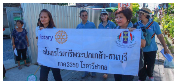
Rotary Club of Phrapokklao Dhonburi made a campaign to preventive mosquitos in Lert Pattana Community, Chom Thong District. (Figure 1-2)