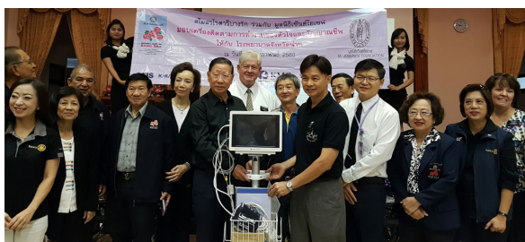
Rotary Club of Bangrak donated heart trackers to Nan Provincial Hospital.