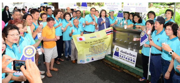
Rotary Club of Sathorn donated water filtration system to Taechew Health Park.

น้ำสะอาดและสุขาภิบาล Water and sanitation