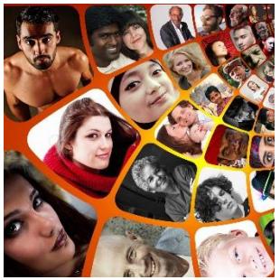
Making references to age, ethnicity, race, color, abilities, religion, socioeconomic status, culture, sex, sexual orientation, or gender identity

It's important for all leaders to take any allegation of harassment seriously and address the situation.