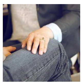
Making or threatening unwelcome physical contact, such as brushing against, embracing, or pinching