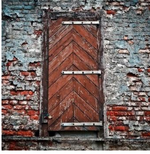
Deliberately impeding a person's movements