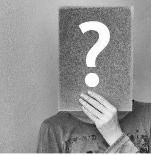
Asking questions or making comments about a person's sexual activity or experiences