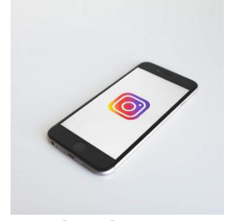
Making derogatory remarks on social media or in email