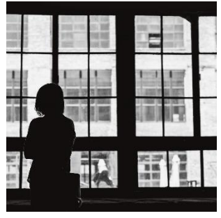
Making jokes or using derogatory language about the characteristics listed above