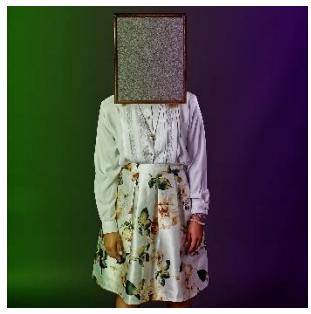
Making unsolicited comments about a person's attractiveness or appearance