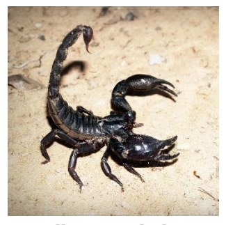
Bullying, including verbal or physical threats or intimidation, based on the characteristics listed above